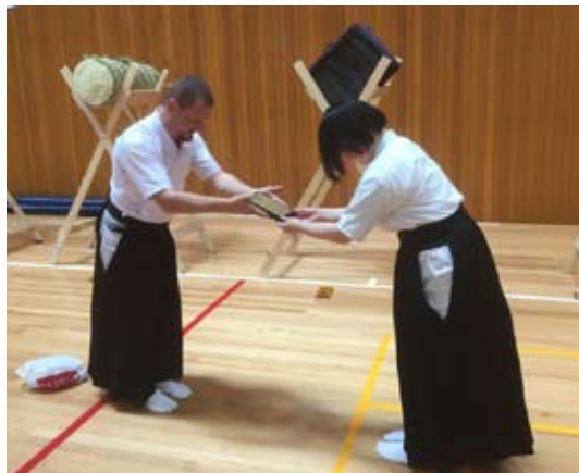
Club spirit award 2016