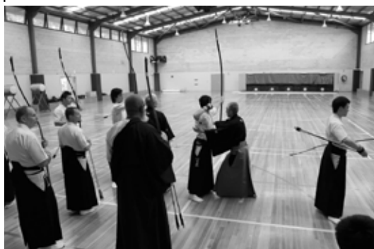
Receiving instruction at the Budokan Seminar