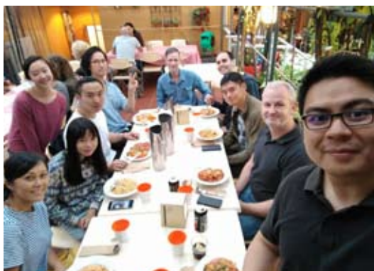
Sharing dinner after training